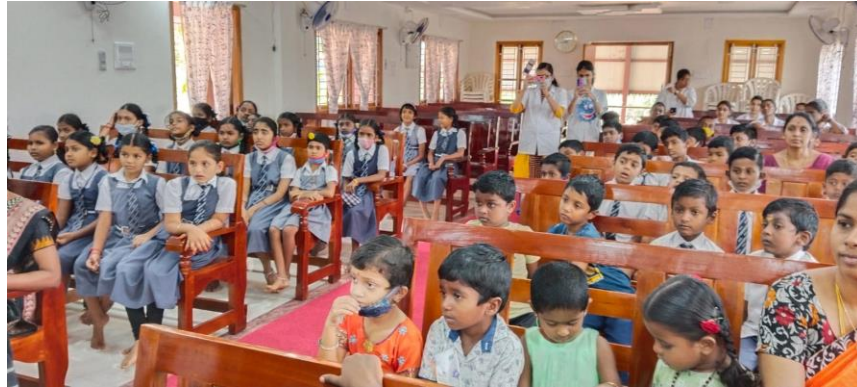
Our keen audience