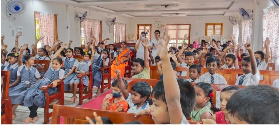
Active participation of students in screening camp